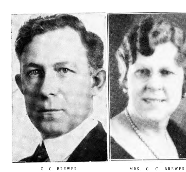
As they looked when most OF these articles were being written.