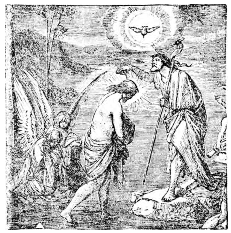
A FALSEHOOD IN PICTURE This is the picture that the Methodist Herald has been running for three months. It is Cain's way. Read this article.

2. The Picture Has Marks of Modern Origin. A close examination of this picture will reveal marks that prove it to be of an origin much later than the New Testament. It